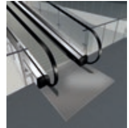
Passenger fall protection barrier